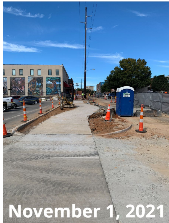
November 1, 2021

A big thank you to the City's Construction Management Division for sharing these pics with us!