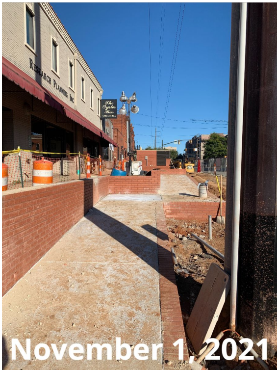
November 1, 2021